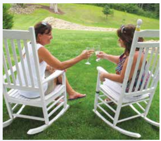
Guests enjoying the Spirit of the Prairie event at Our Lady of the Prairie Retreat.

committed to serving meals using naturally-raised healthy foods. Our garden grows many of the vegetables used in our meals, and our greenhouse was built in 2014 to provide fresh greens throughout the year.