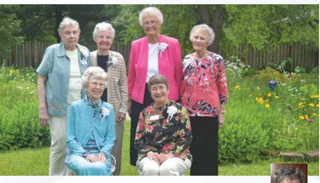
"We are deeply grateful for sisters, associates, family and friends who have accompanied us on our journey into Jubilee. May God continue to bless all with a spirit of humility, simplicity and joy as the the future unfolds before us."